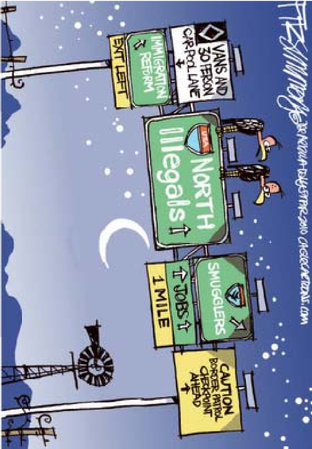
I HEAR THEY JUST GAVE UP AND BUILT AN EXPRESSWAY.