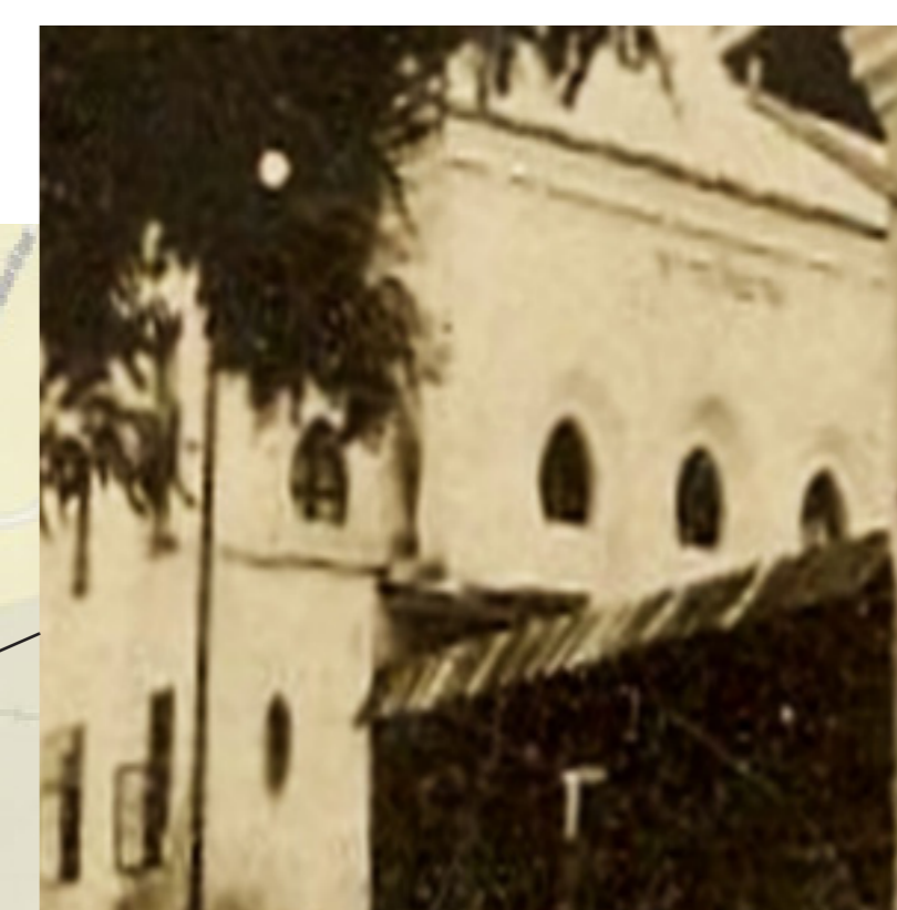
The Talmud Tora Synagogue