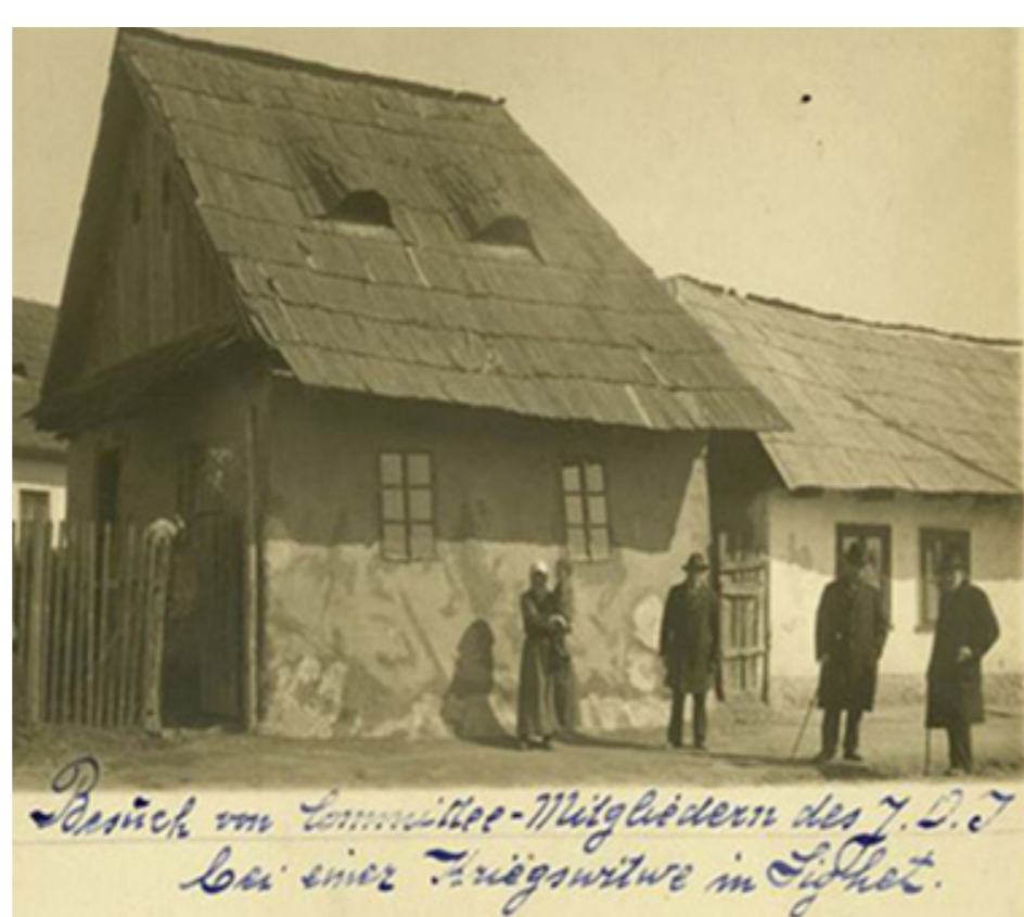
Deitch von Lammittel-Mitglieder des J. D. I. Bau einer Trigonometrie in Sighet.

In the town, the majority of the houses were built in the same way, but this is not necessarily a sign of Jewish architecture. One interesting detail is that on the front walls of some houses, the family seal was carved on 4 big stone plates in 4 different languages.