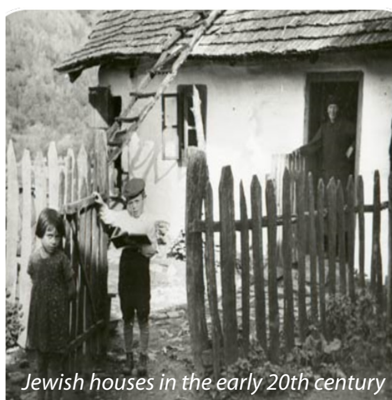
Jewish houses in the early 20th century

In the early years of the 20th century, between 1920- 1930 the Jewish households around Sighet looked just like the Romanian ones. One difference was that the Jews built their basements far from the house because of the Kashrut laws (the ones referring to food). Later, in the villages, as the Jews became merchants, they began to build their houses with the front walls directly to the street.