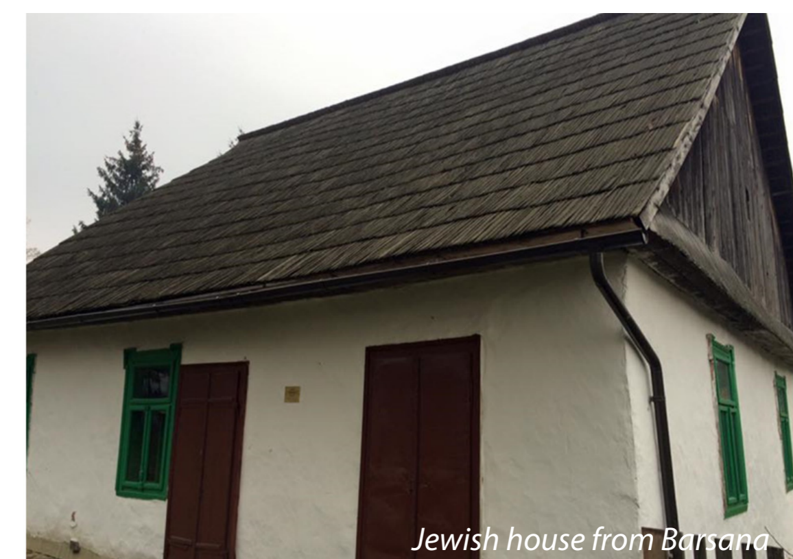
Jewish house from Barsana