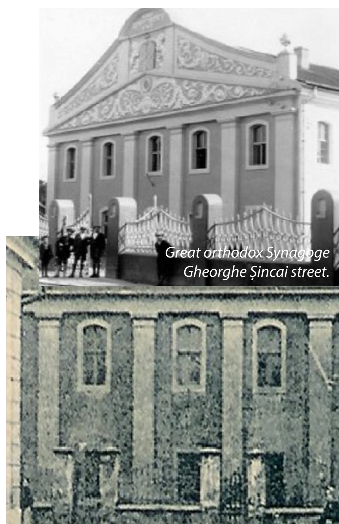
Great orthodox Synagogue Georghie Şincai street.