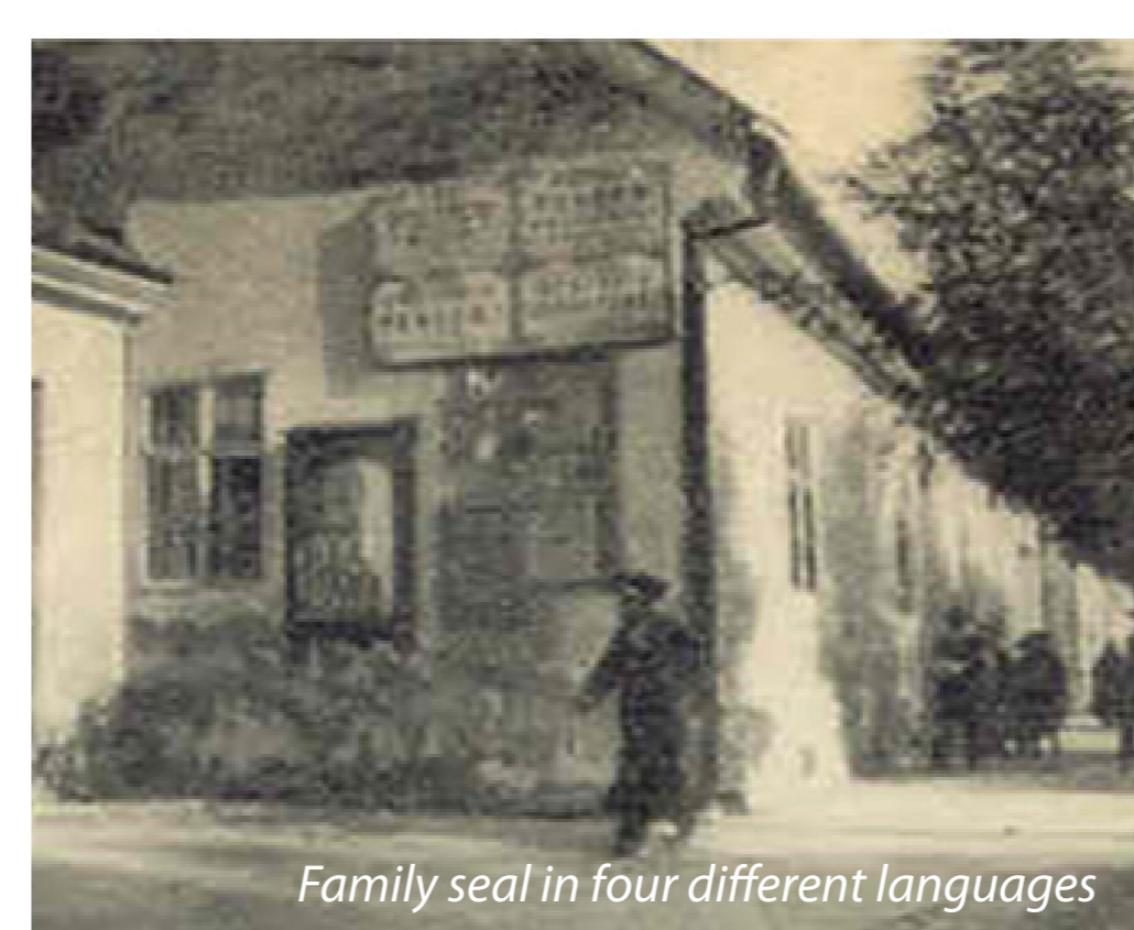
Family seal in four different languages