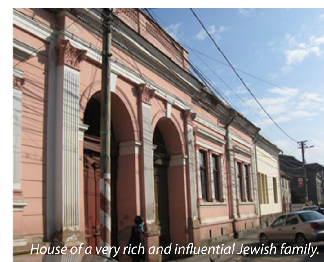
House of a very rich and influential Jewish family.