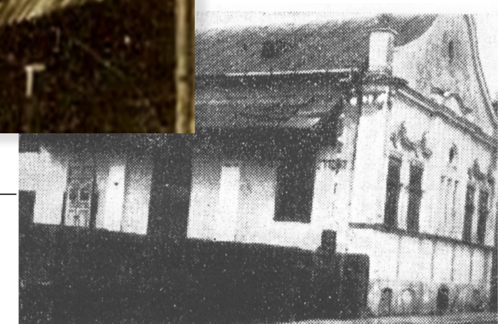
The old Sephardic Synagogue - Basarabia street