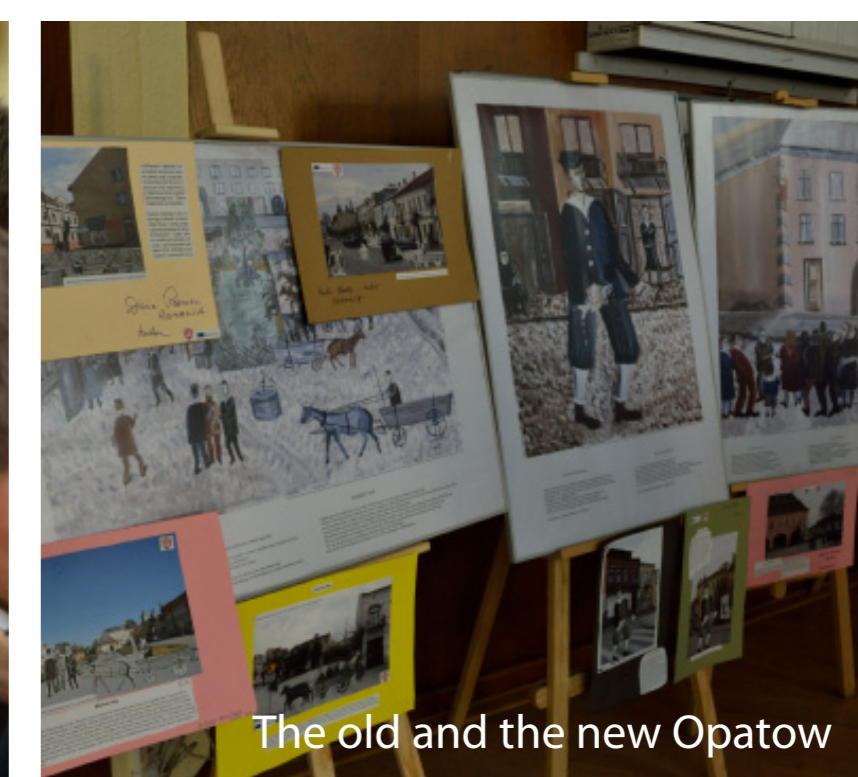
The old and the new Opatow