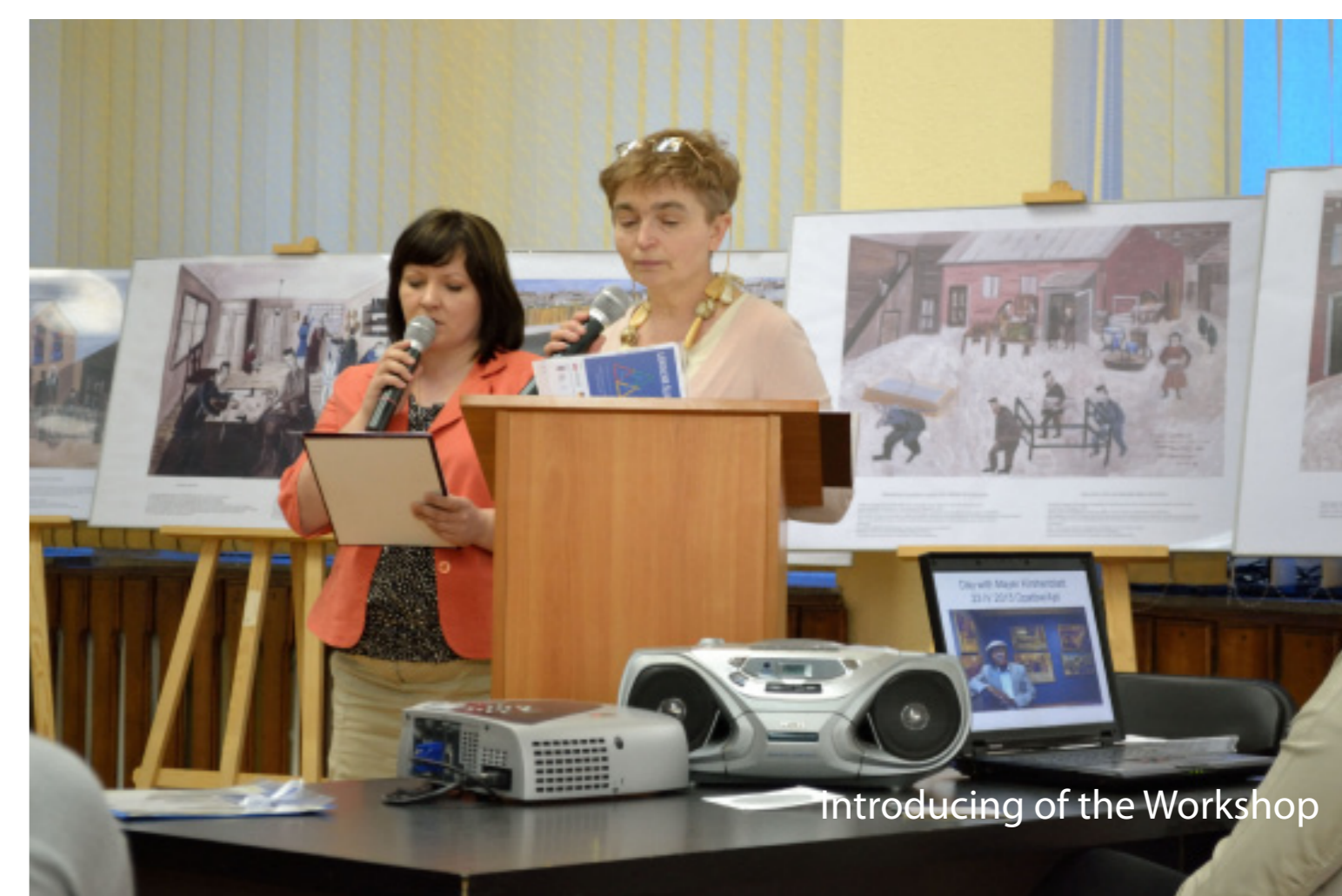
Introducing of the Workshop