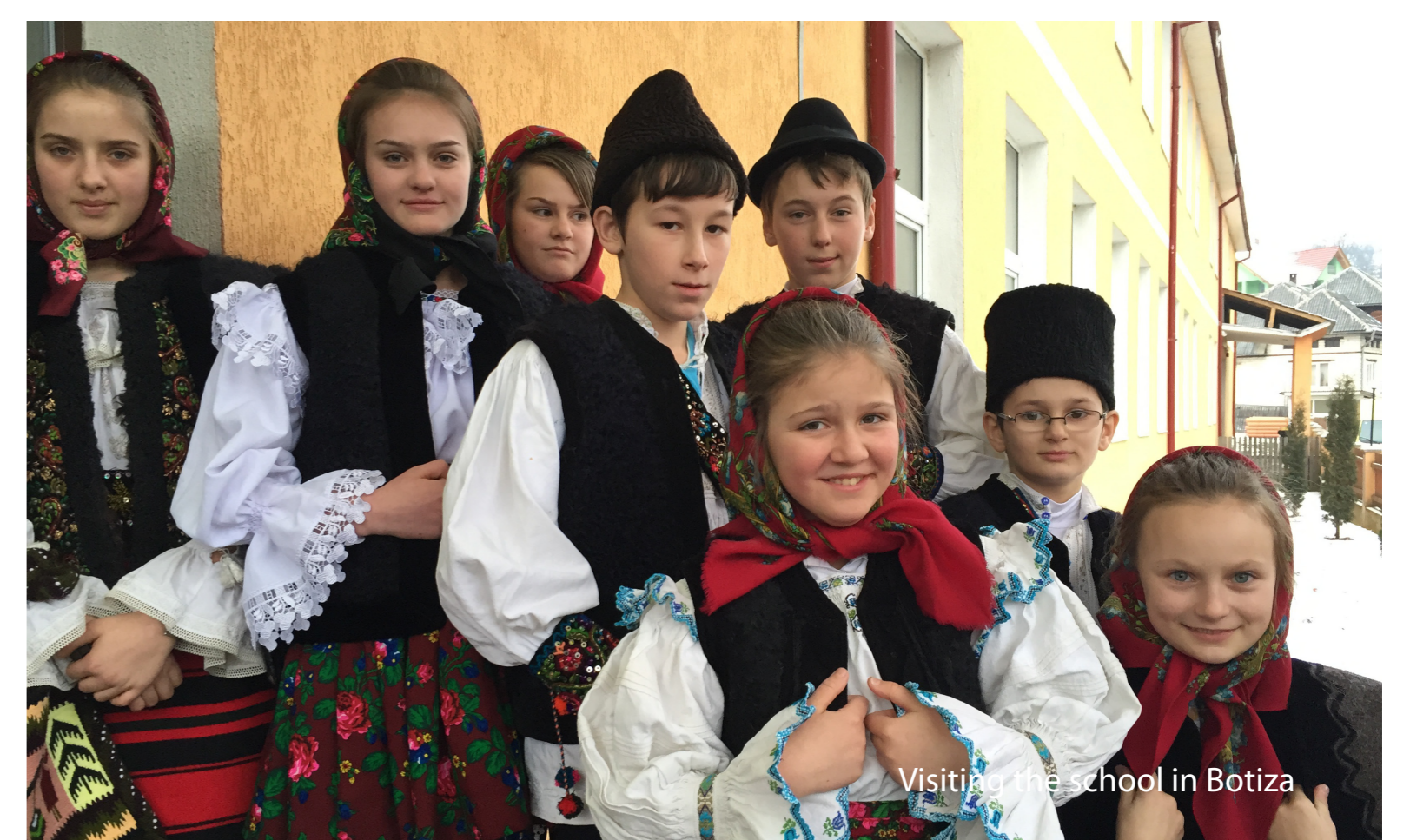
Visiting the school in Botiza