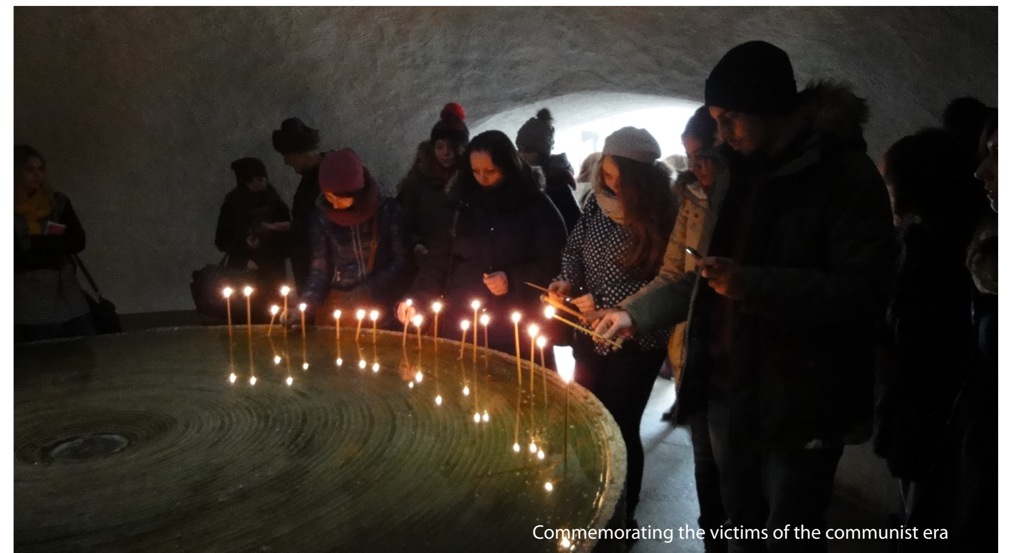
Commemorating the victims of the communist era

Later the team made a trip to Bârsana and visited Bârsana Monastery, one of the most famous tourist attraction of the county, where they saw the traditional wooden buildings typical for Maramures architecture. Afterwards they met a woodcarver who explained to them some of the symbols of the wooden gates and they could admire some of his work shown there.