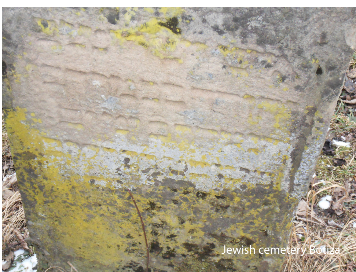
Jewish cemetery Botiza