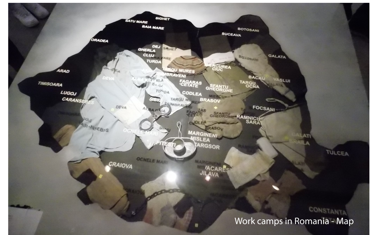
Work camps in Romania - Map