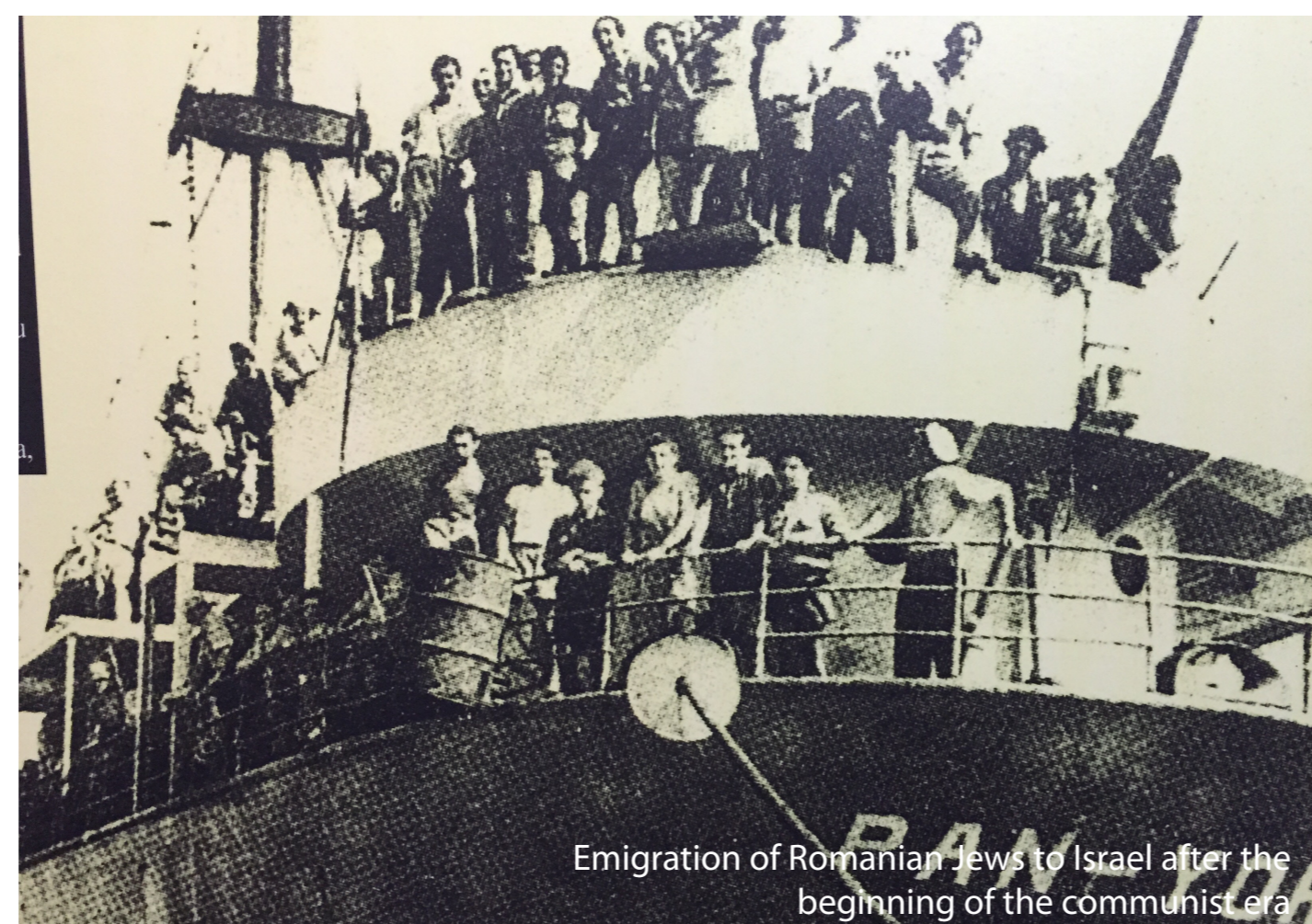
Emigration of Romanian Jews to Israel after the beginning of the communist era